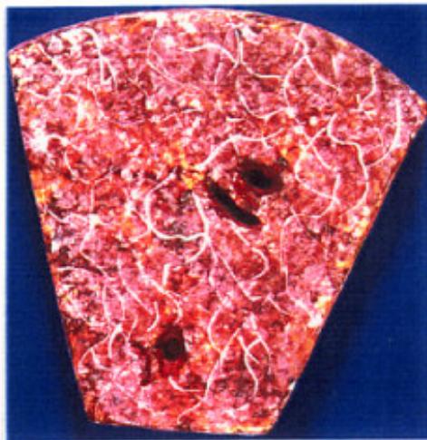
A non-smoker's lung is pink in color.